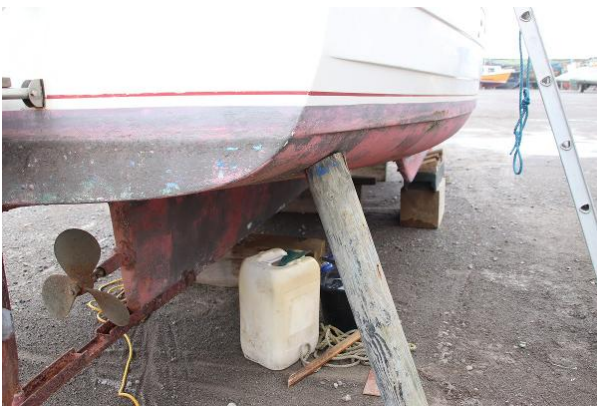
Colvic Family Fisher prop and keel