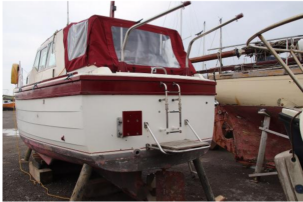
Colvic Family Fisher stern view with cover