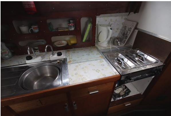
Colvic Family Fisher galley