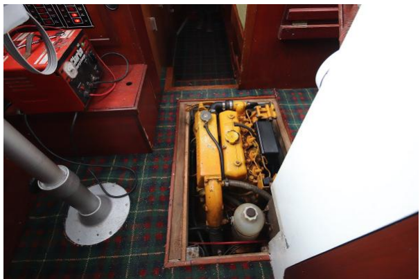
Colvic Family Fisher engine