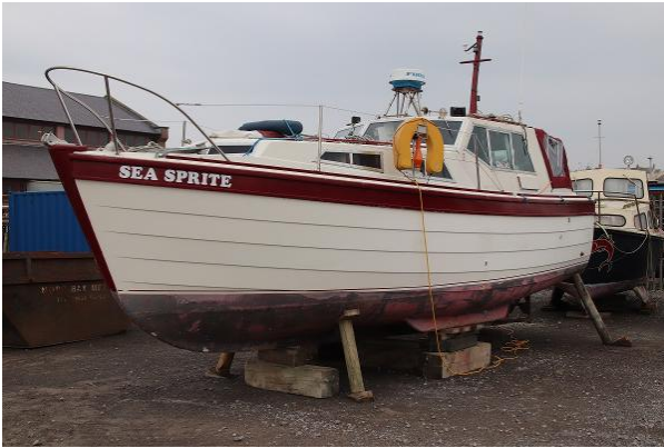
Colvic Family Fisher port side view