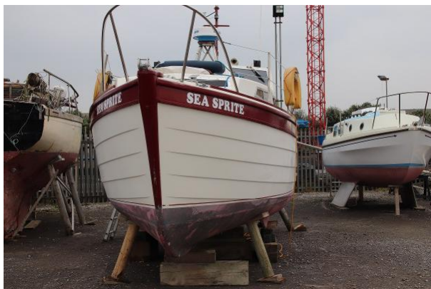
Colvic Family Fisher bows view