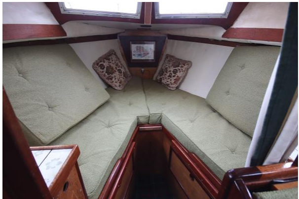
Colvic Family Fisher forecabin