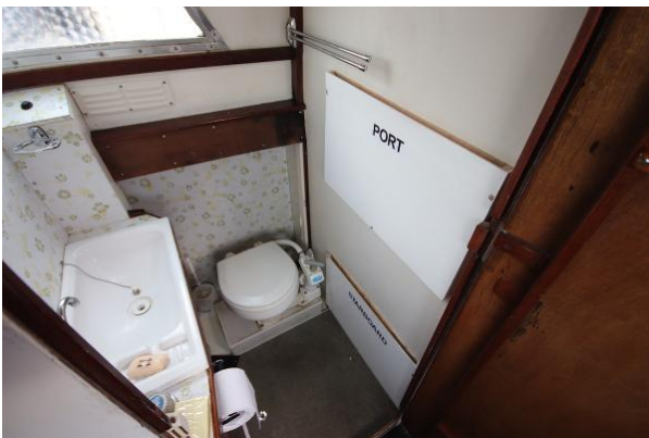
Colvic Family Fisher heads