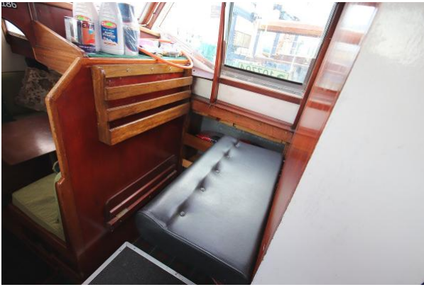
Colvic Family Fisher additional seat in wheelhouse