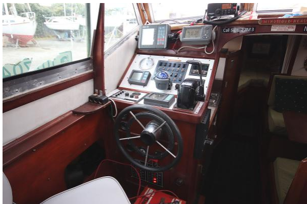
Colvic Family Fisher helm position