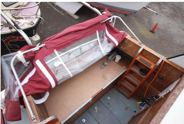
Colvic Family Fisher cockpit