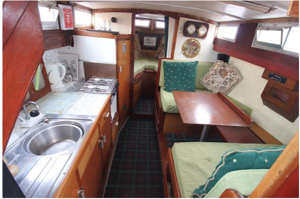
Colvic Family Fisher saloon