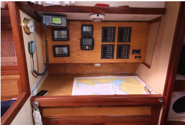
Ocean Going Sea Trader chart table