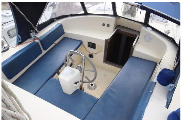
Ocean Going Sea Trader cockpit with cushions