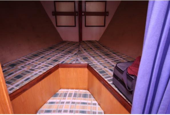
Ocean Going Sea Trader forecabin