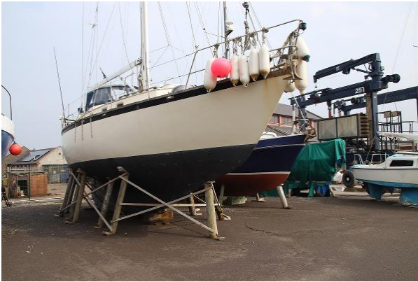
Ocean Going Sea Trader on the hard