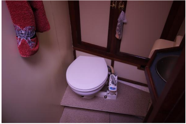
Ocean Going Sea Trader forward heads