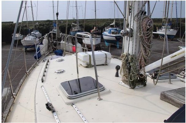
Ocean Going Sea Trader deck view