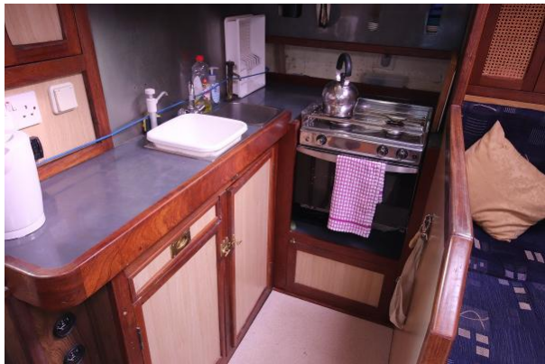
Ocean Going Sea Trader galley