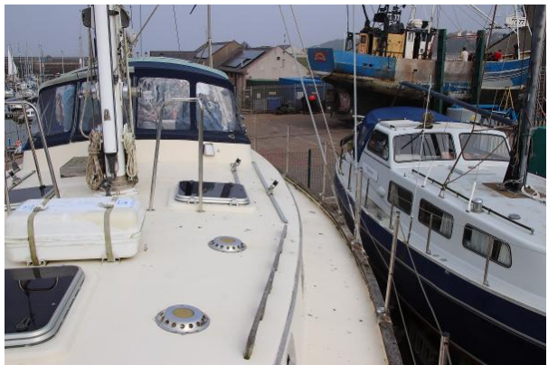
Ocean Going Sea Trader looking aft