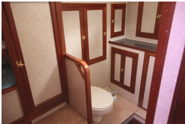
Ocean Going Sea Trader master ensuite