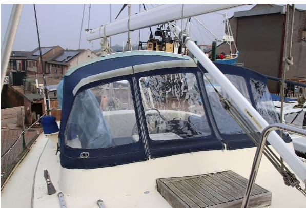
Ocean Going Sea Trader sprayhood