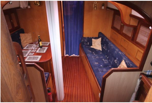
Ocean Going Sea Trader saloon