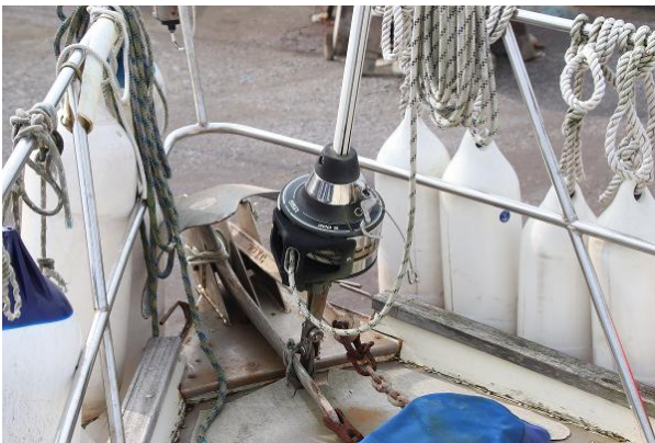
Ocean Going Sea Trader furling gear