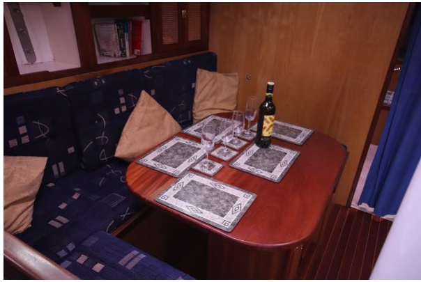
Ocean Going Sea Trader saloon table