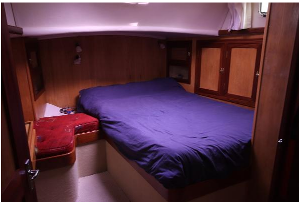
Ocean Going Sea Trader master cabin