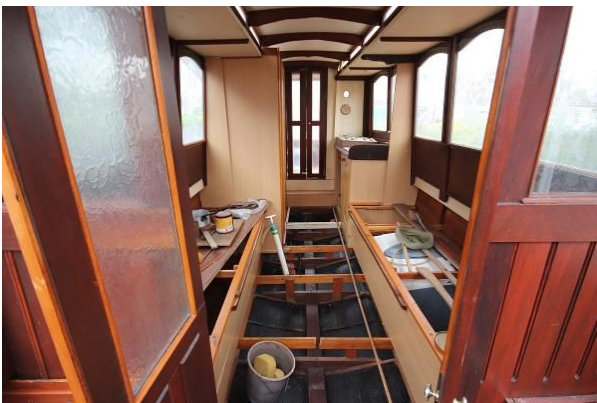
Selway Fisher saloon