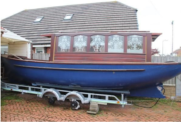
Selway Fisher Edwardian 26