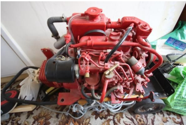
Selway Fisher new Beta engine