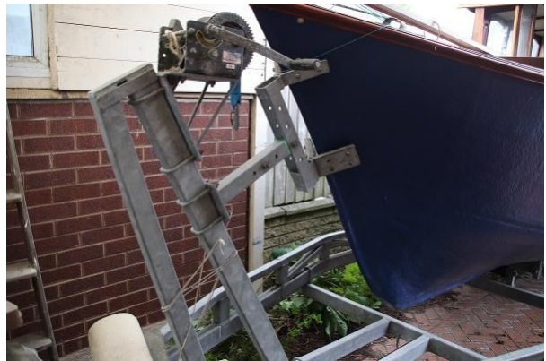
Selway Fisher road trailer