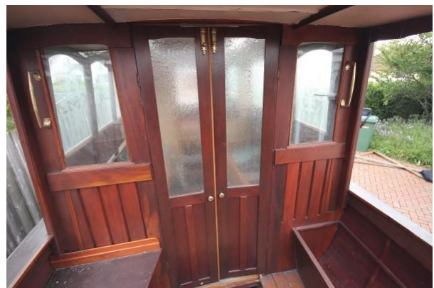
Selway Fisher doors from foredeck