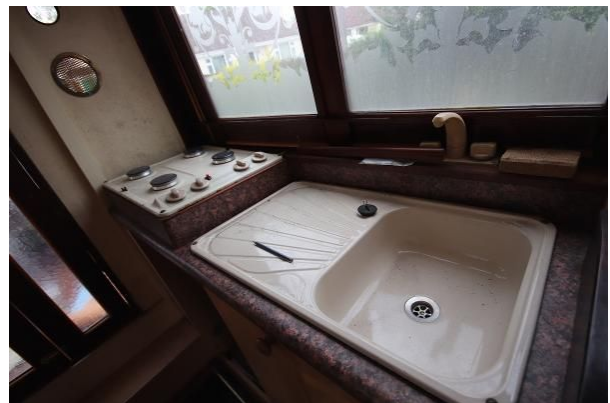
Selway Fisher galley