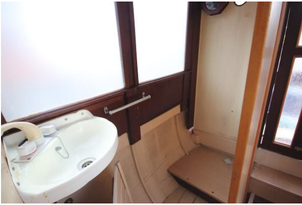
Selway Fisher heads