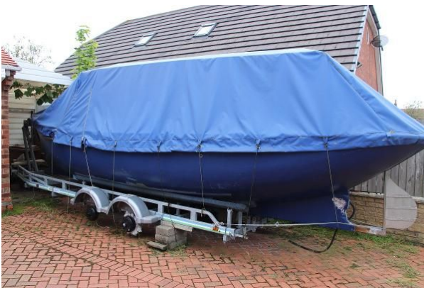
Selway Fisher all over fitted cover