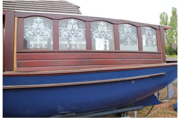
Selway Fisher part completed