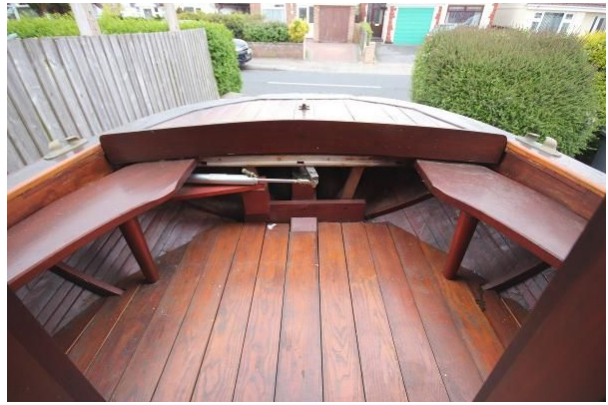
Selway Fisher after deck