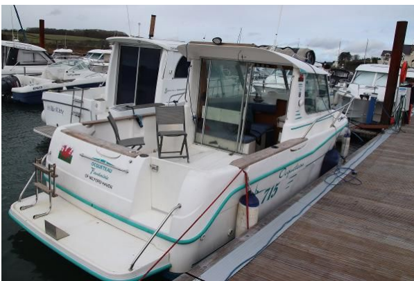
Ocqueteau 715 stern view