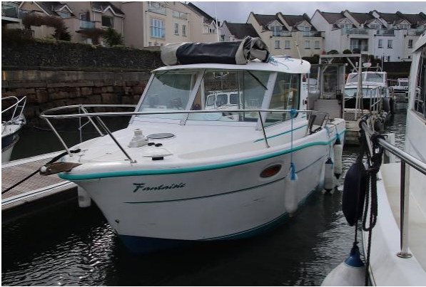
Ocqueteau 715 on her berth