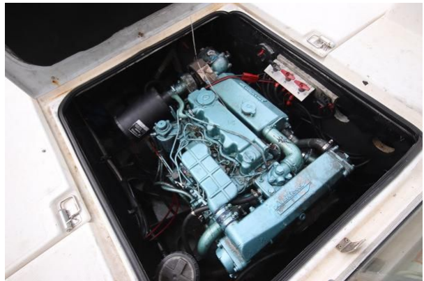
Ocqueteau 715 Nanni engine