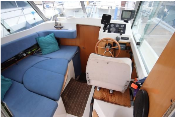
Ocqueteau 715 berth created