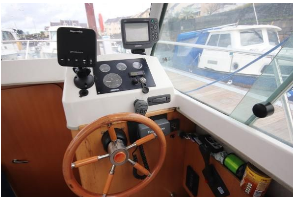
Ocqueteau 715 helm position