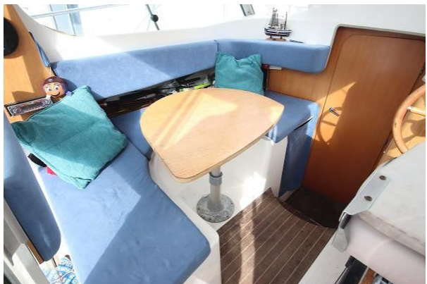
Ocqueteau 715 seating and table