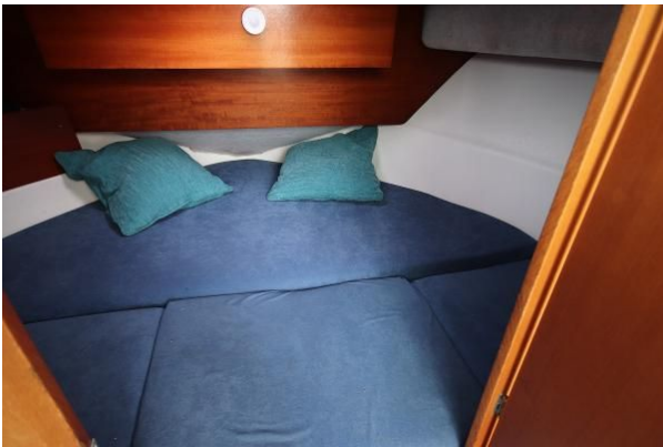
Ocqueteau 715 forecabin