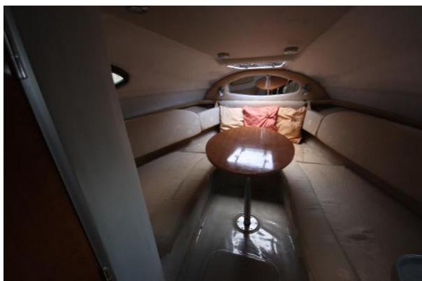
Regal Commodore 2465 salon