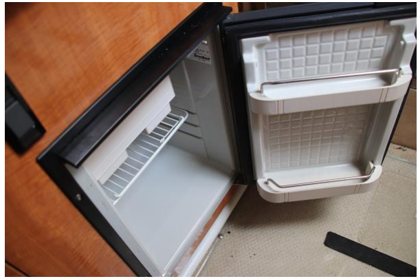
Regal Commodore 2465 fridge