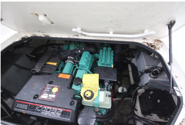
Regal Commodore 2465 engine