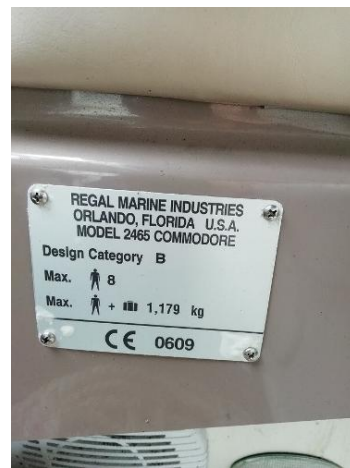
Regal Commodore 2465 CE plate