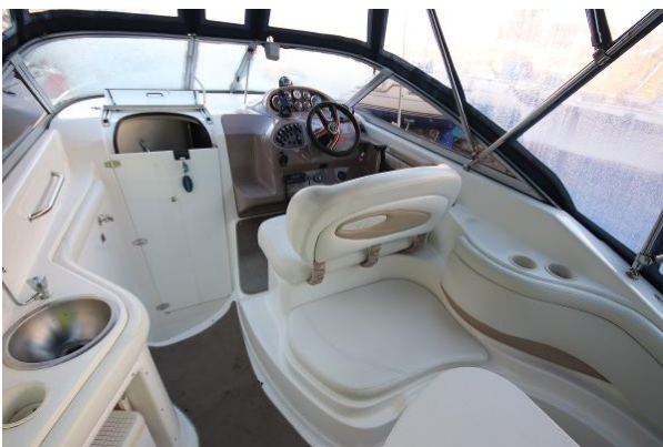
Regal Commodore 2465 looking forward