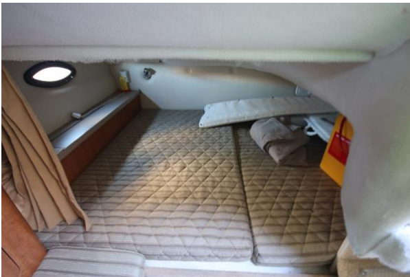
Regal Commodore 2465 aft berth