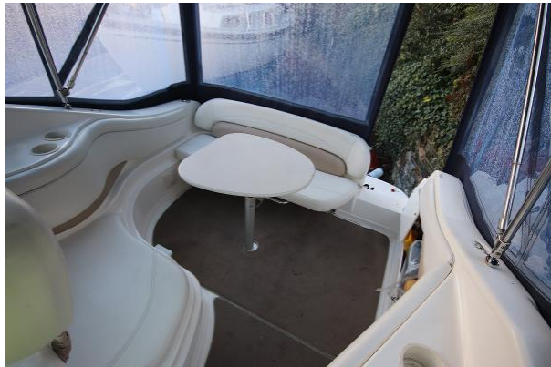
Regal Commodore 2465 cockpit