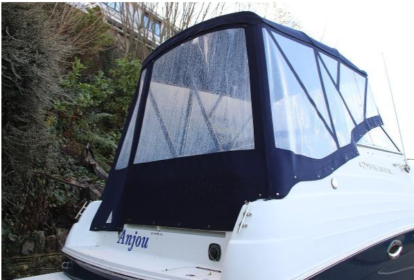
Regal Commodore 2465 new cover