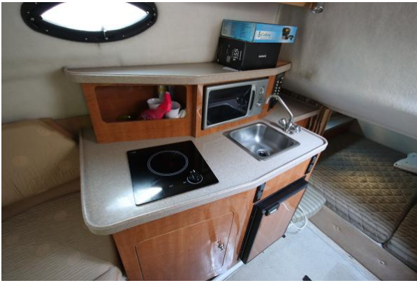
Regal Commodore 2465 galley