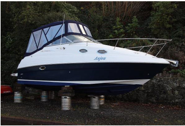
Regal Commodore 2465 Anjou