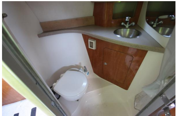
Regal Commodore 2465 heads