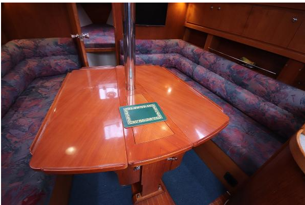
Moody 35 saloon table