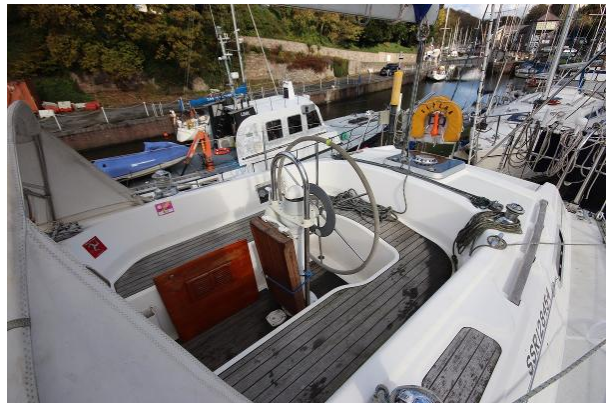
Moody 35 cockpit