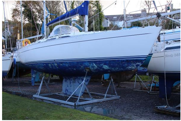
Moody 35 fin keel