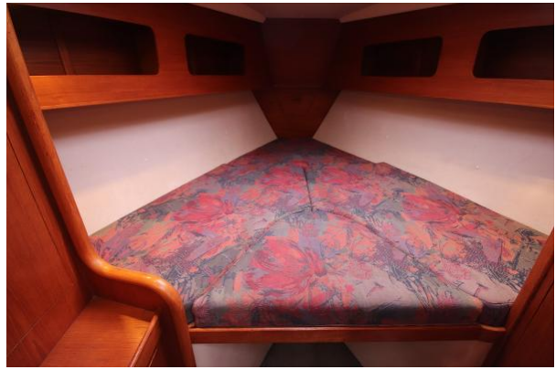
Moody 35 forecabin