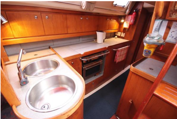
Moody 35 galley