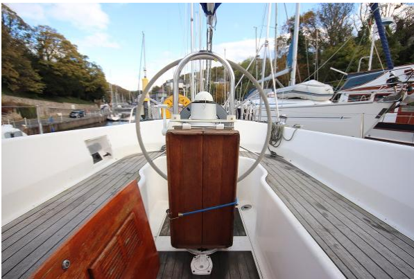
Moody 35 helm