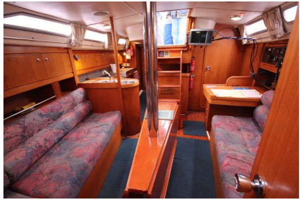
Moody 35 below looking aft