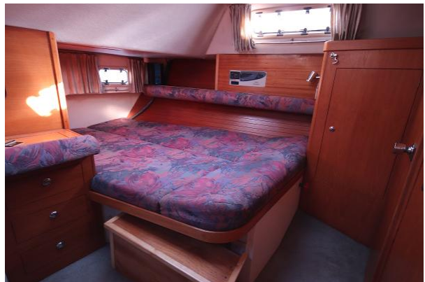
Moody 35 owners cabin