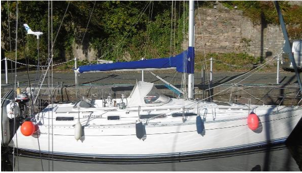
Moody 35 Serena