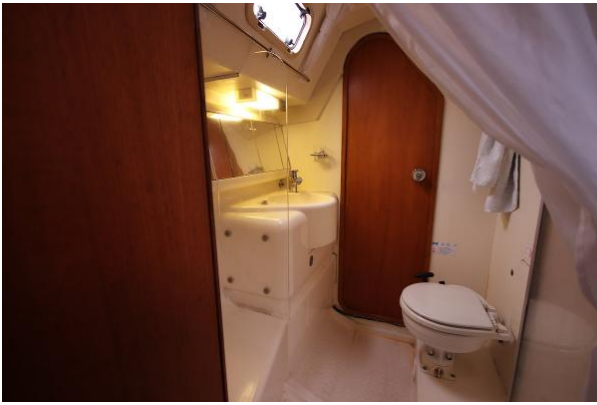
Moody 35 heads and shower