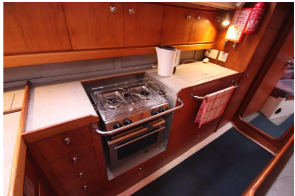
Moody 35 stove