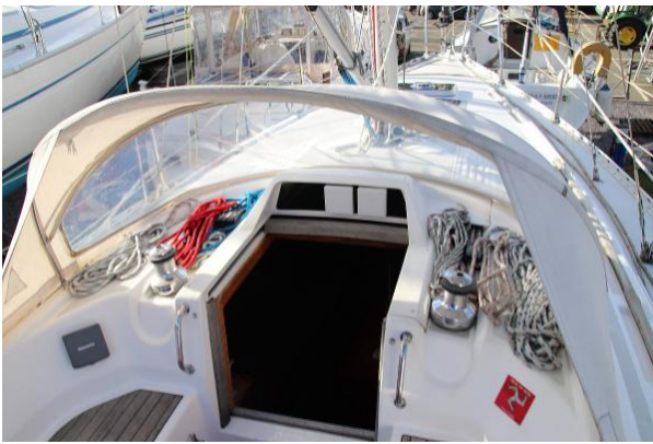
Moody 35 looking forward