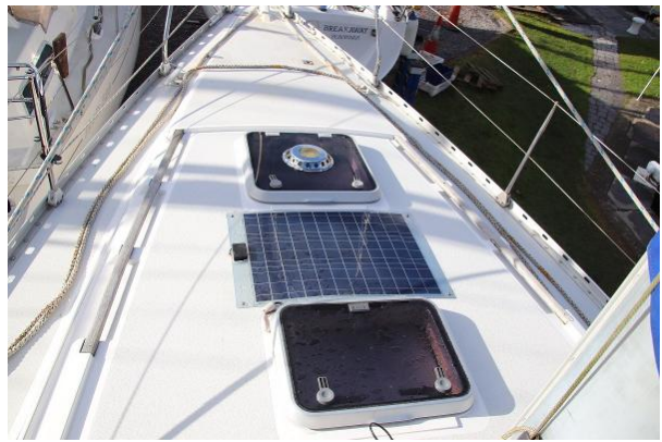
Moody 35 foredeck