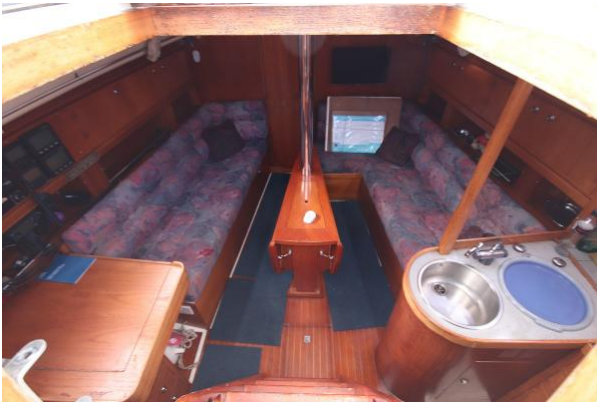
Moody 35 below