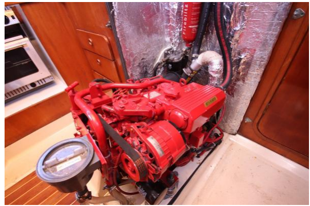
Oyster Lightwave 395 engine