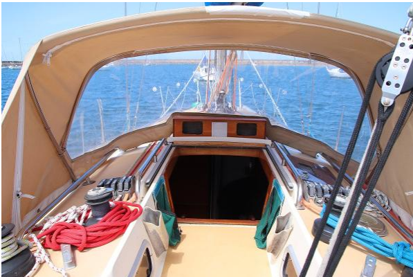
Oyster Lightwave 395 sprayhood and main hatch