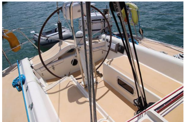
Oyster Lightwave 395 helm