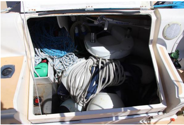
Oyster Lightwave 395 cockpit locker