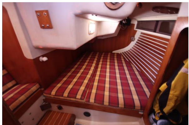
Oyster Lightwave 395 aft cabin