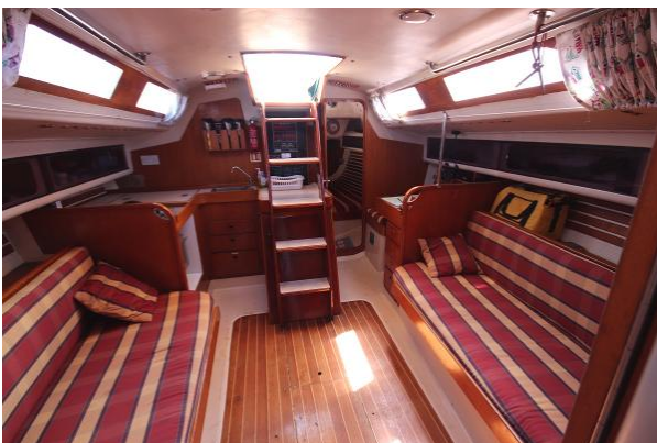
Oyster Lightwave 395 looking aft