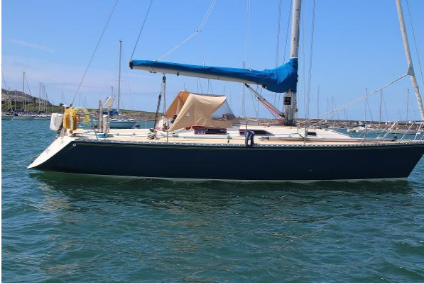
Oyster Lightwave 395 Blue Pearl