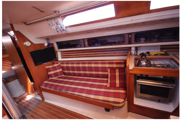
Oyster Lightwave 395 saloon seating