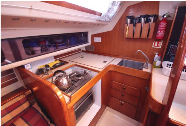
Oyster Lightwave 395 galley