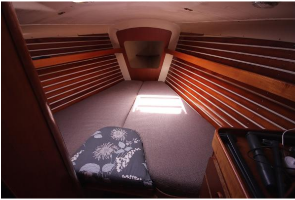
Oyster Lightwave 395 forecabin