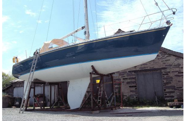
Oyster Lightwave 395 hull view