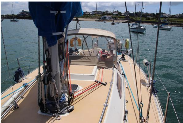
Oyster Lightwave 395 lines led aft