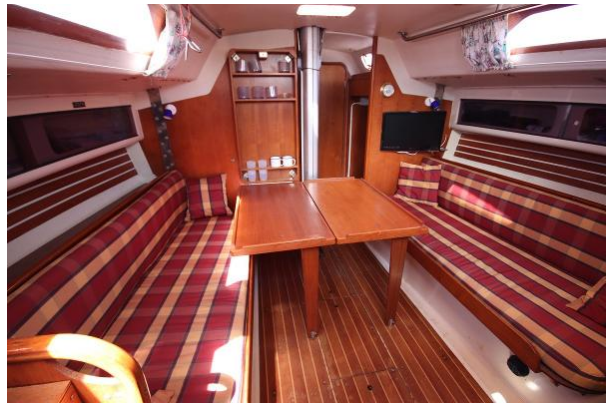
Oyster Lightwave 395 saloon with table