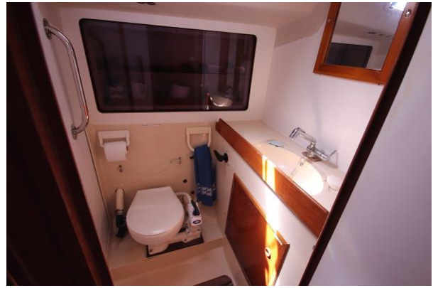
Oyster Lightwave 395 heads