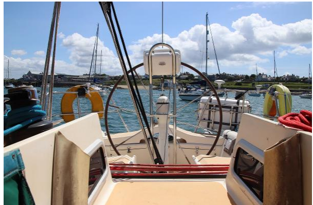
Oyster Lightwave 395 looking aft from main hatch