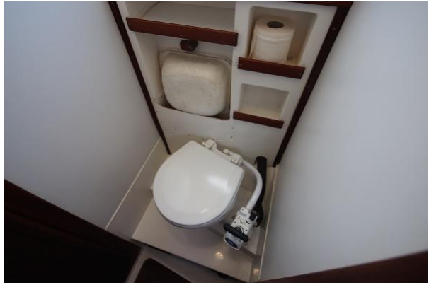
Dockrell 27 heads