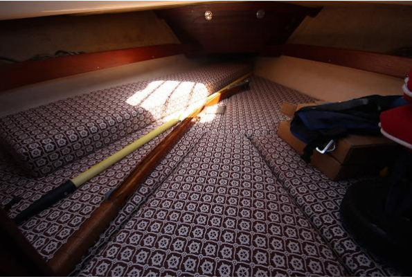
Dockrell 27 foreberth