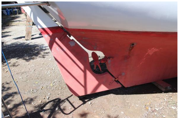
Dockrell 27 rudder and prop