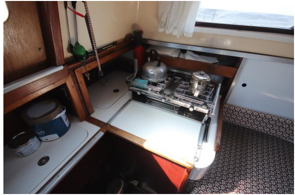
Dockrell 27 galley