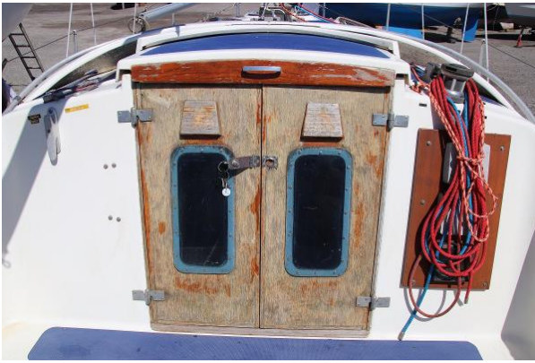
Dockrell 27 mainhatch