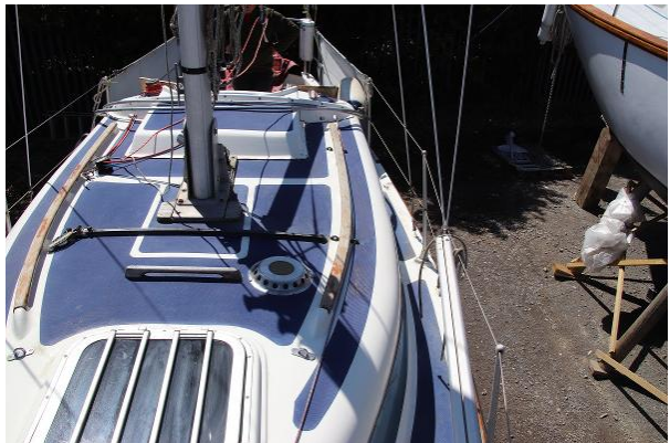
Dockrell 27 looking aft