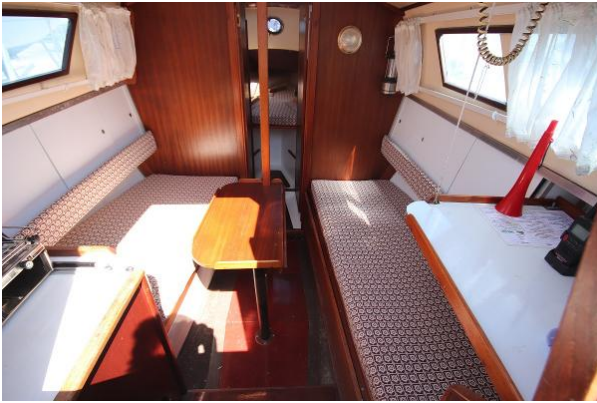
Dockrell 27 saloon