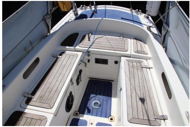
Dockrell 27 cockpit