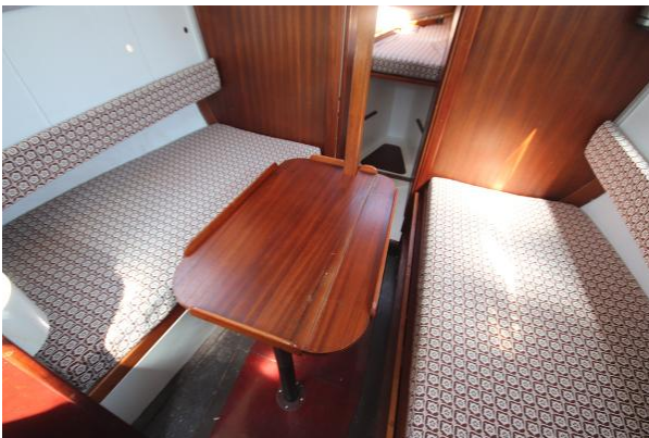
Dockrell 27 saloon table