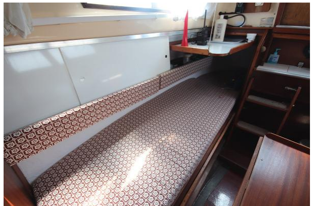
Dockrell 27 long single berth or double