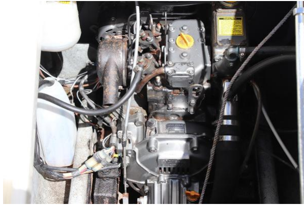
Dockrell 27 engine