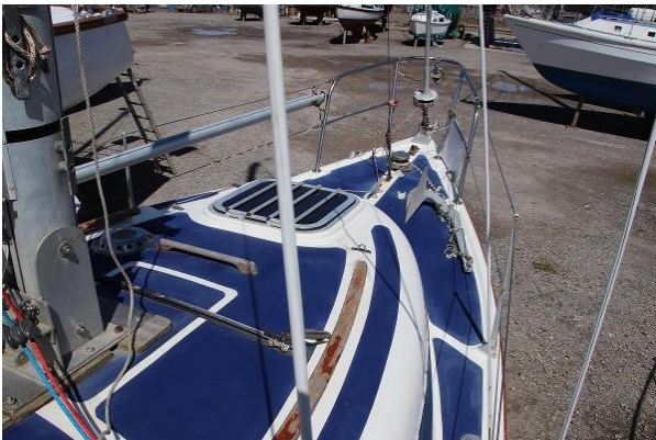
Dockrell 27 foredeck