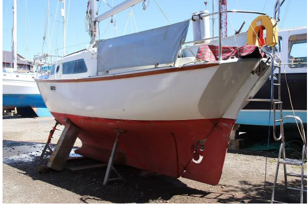
Dockrell 27 wing keel