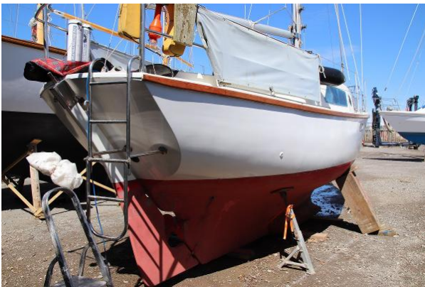
Dockrell 27 stern view