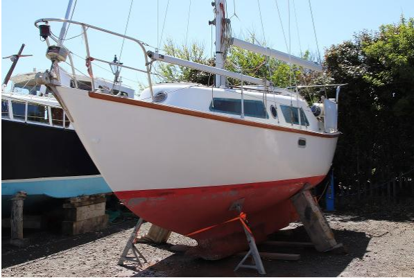
Dockrell 27 on her storage legs